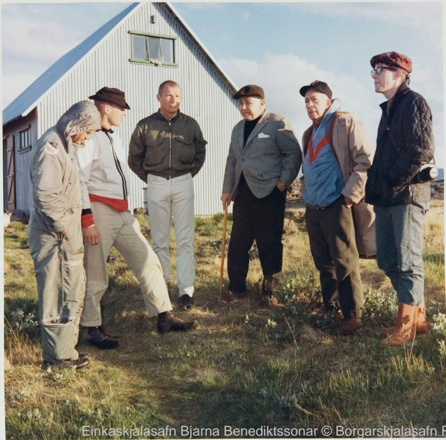
Einkaskjalasafn Bjarna Benediktssonar