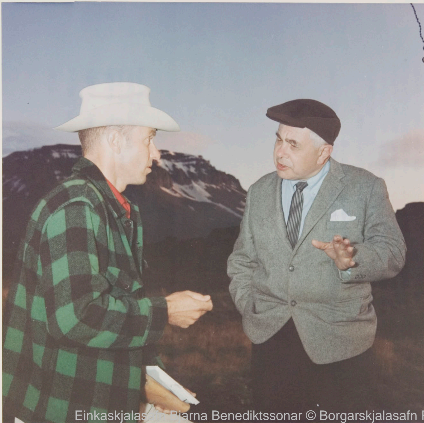
Einkaskjalasafn Biarna Benediktssonar © Borgarskjalasafn Reykjavíkur