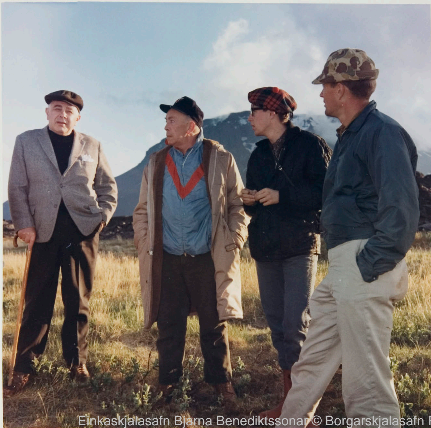
Einkaskjallasafn Bjarna Benediktssonar