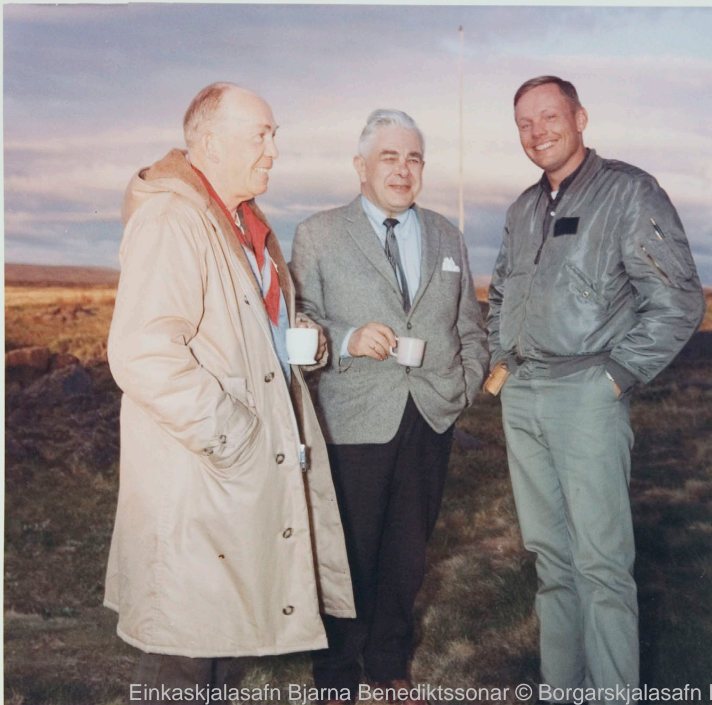
Einkaskjalasafn Bjarna Benediktssonar © Borgarskjalasafn Reykjavíkur