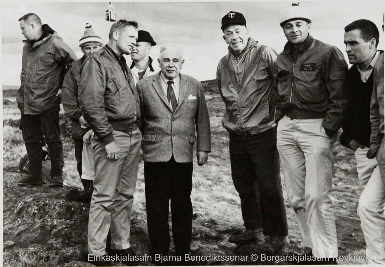
Einkaskjallasafn Bjarna Benediktssonar © Borgarskjallasafn Reykjavíkur