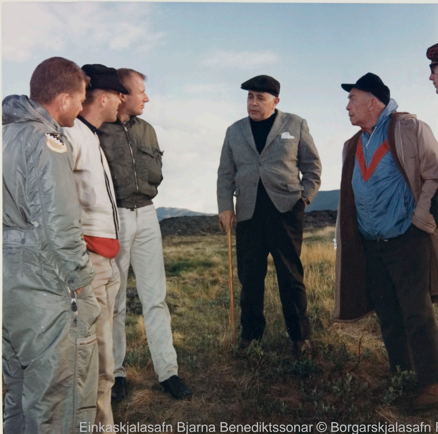
Einkaskjallasafn Bjarna Benediktssonar © Borgarskjallasafn Reykjavíkur