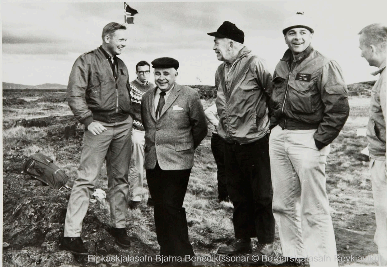
Einkaskjalasafn Bjarna Benediktssonar