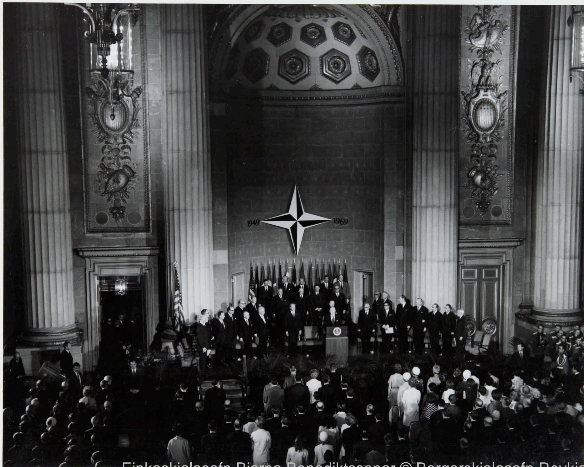
Einkaskjallasafn Bjarna Benediktssonar