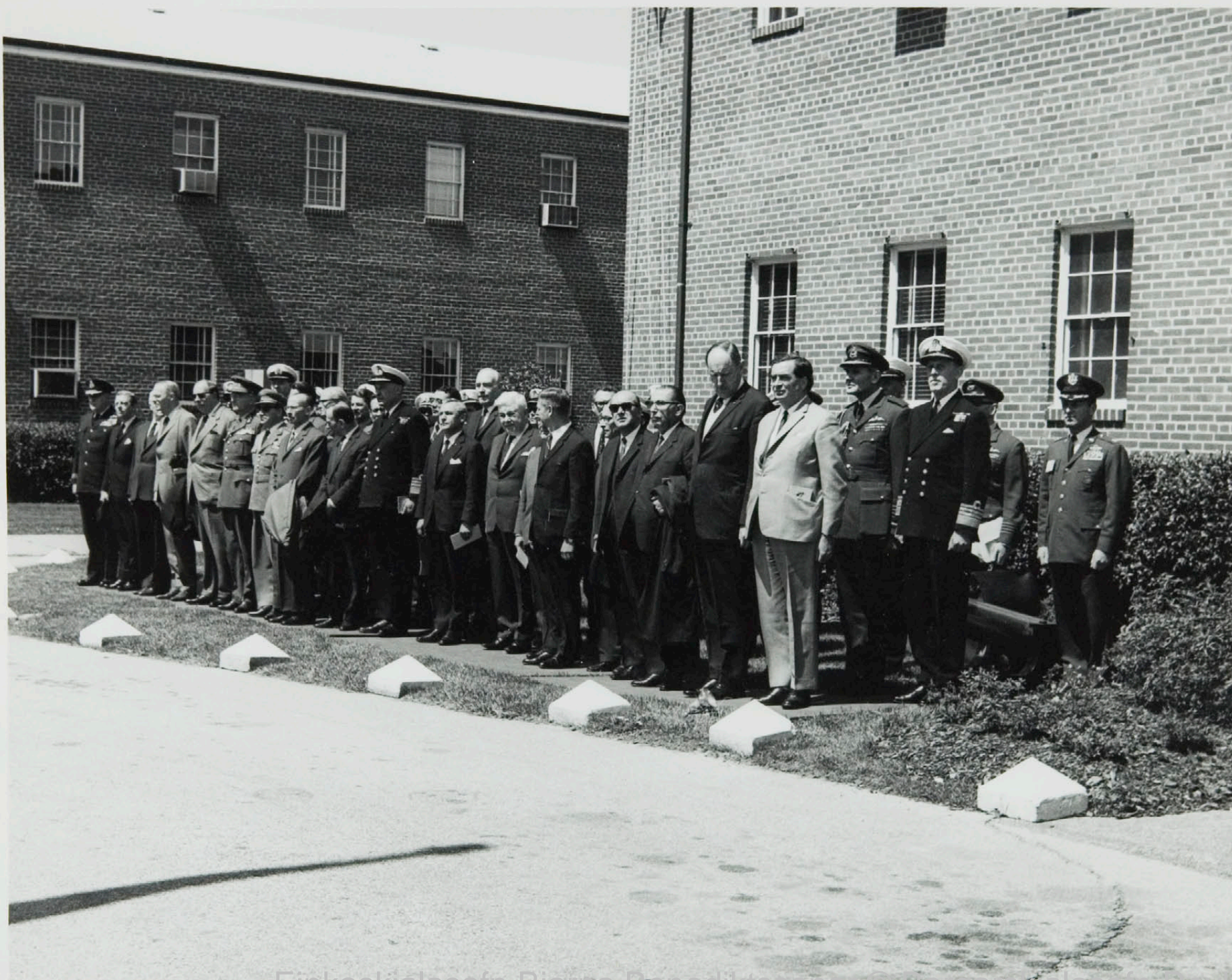
Einkaskjallasafn Bjarna Benediktssonar © Borgarskjalasam Reykjavíkur