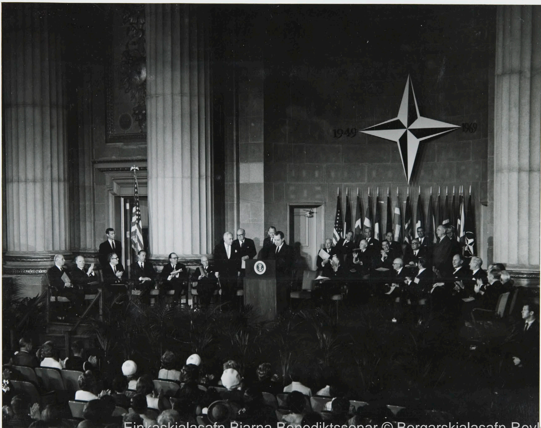
Einkaskjallasafn Bjarna Benediktssonar © Borgarskjallasafn Reykjavíkur