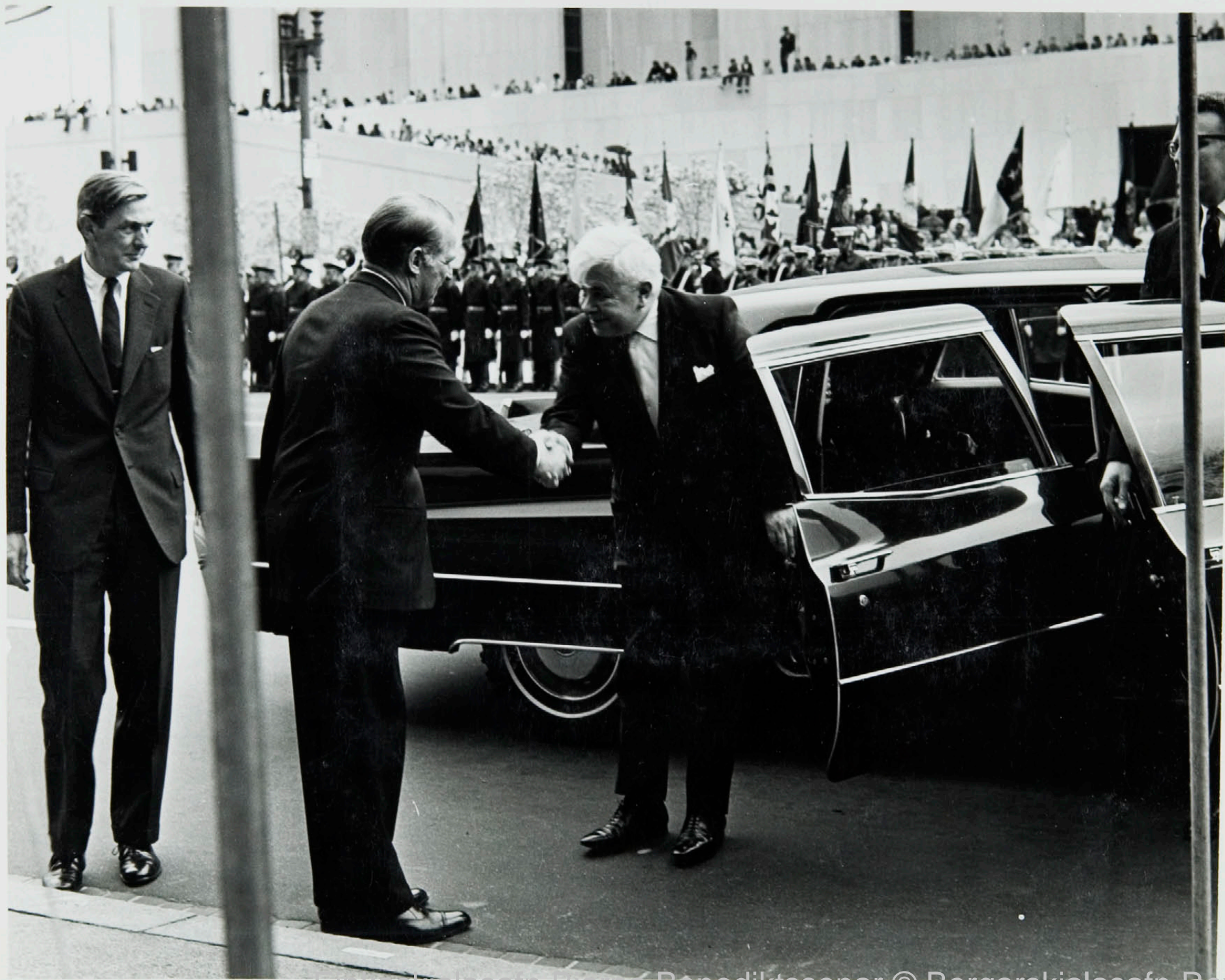
Einkaskjallasarn Bjarna Benediktssonar