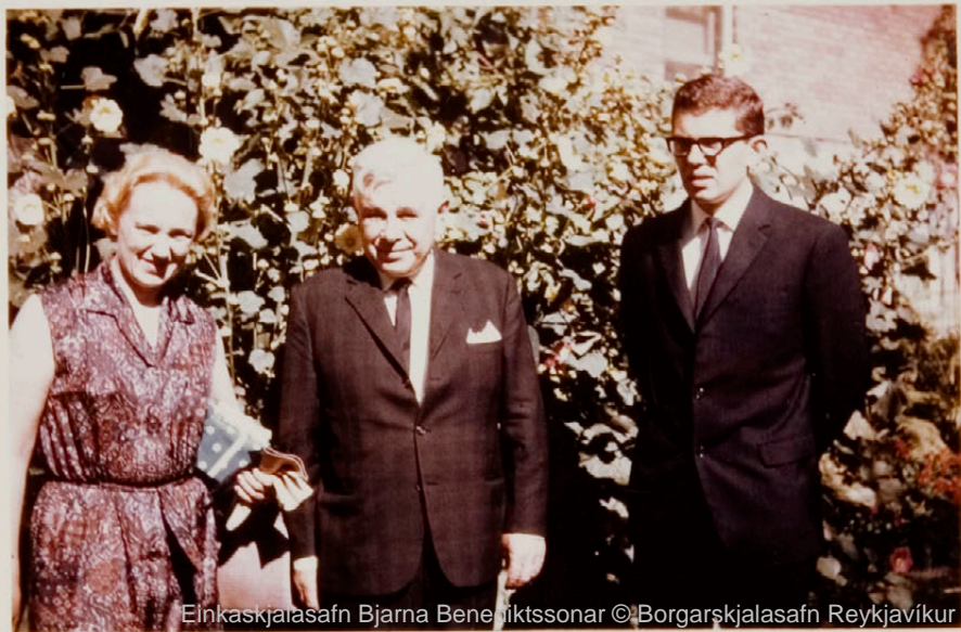
Einkaskjalasafn Bjarna Benediktssonar