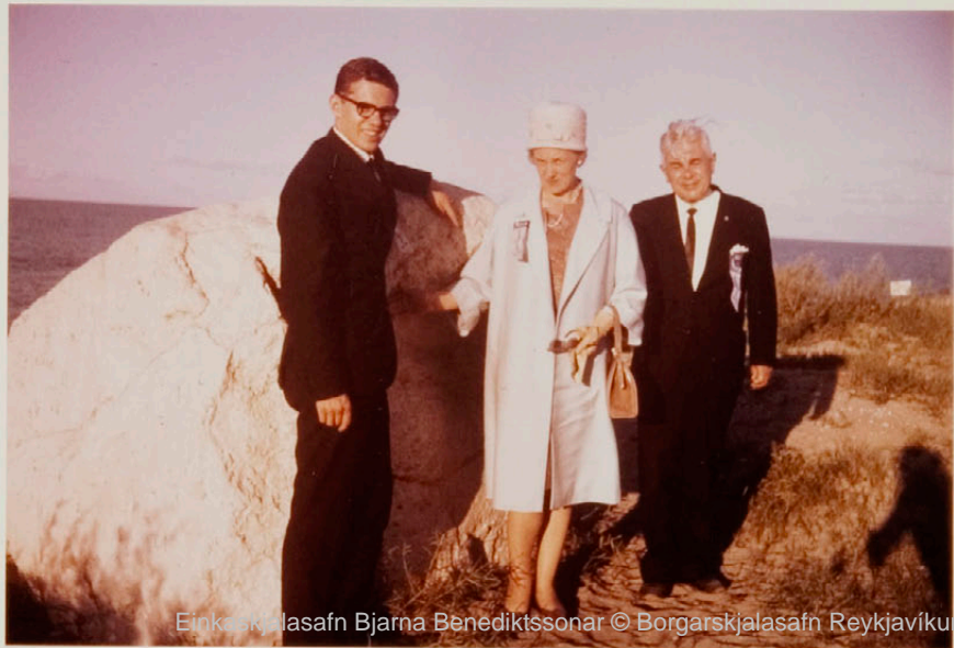
Einkaskjalasafn Bjarna Benediktssonar © Borgarskjalasafn Reykjavíkur