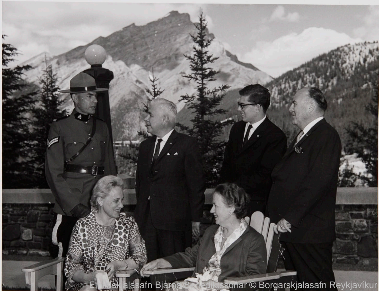
Eiðaskjalasafn Bjarna Benediktssonar © Borgarskjalasafn Reykjavíkur