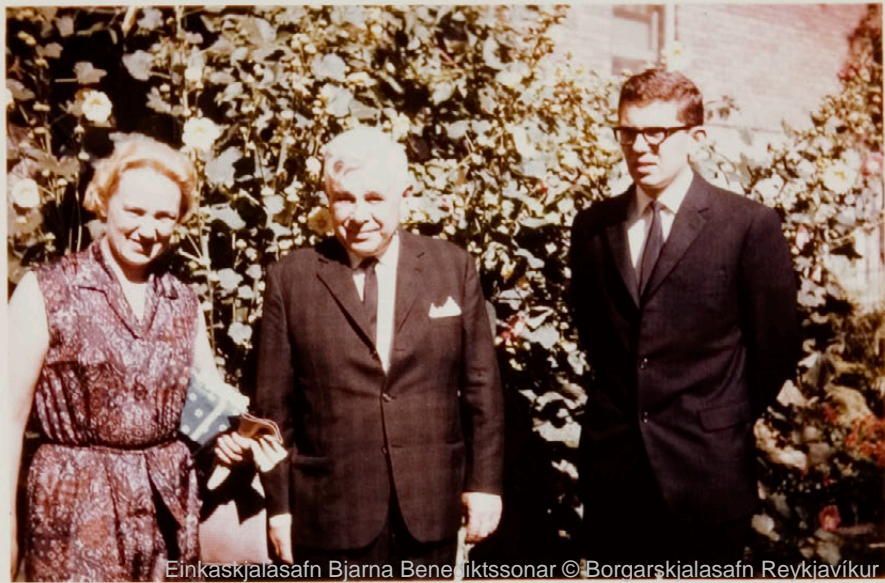
Einkaskjalasafn Bjarna Benediktssonar