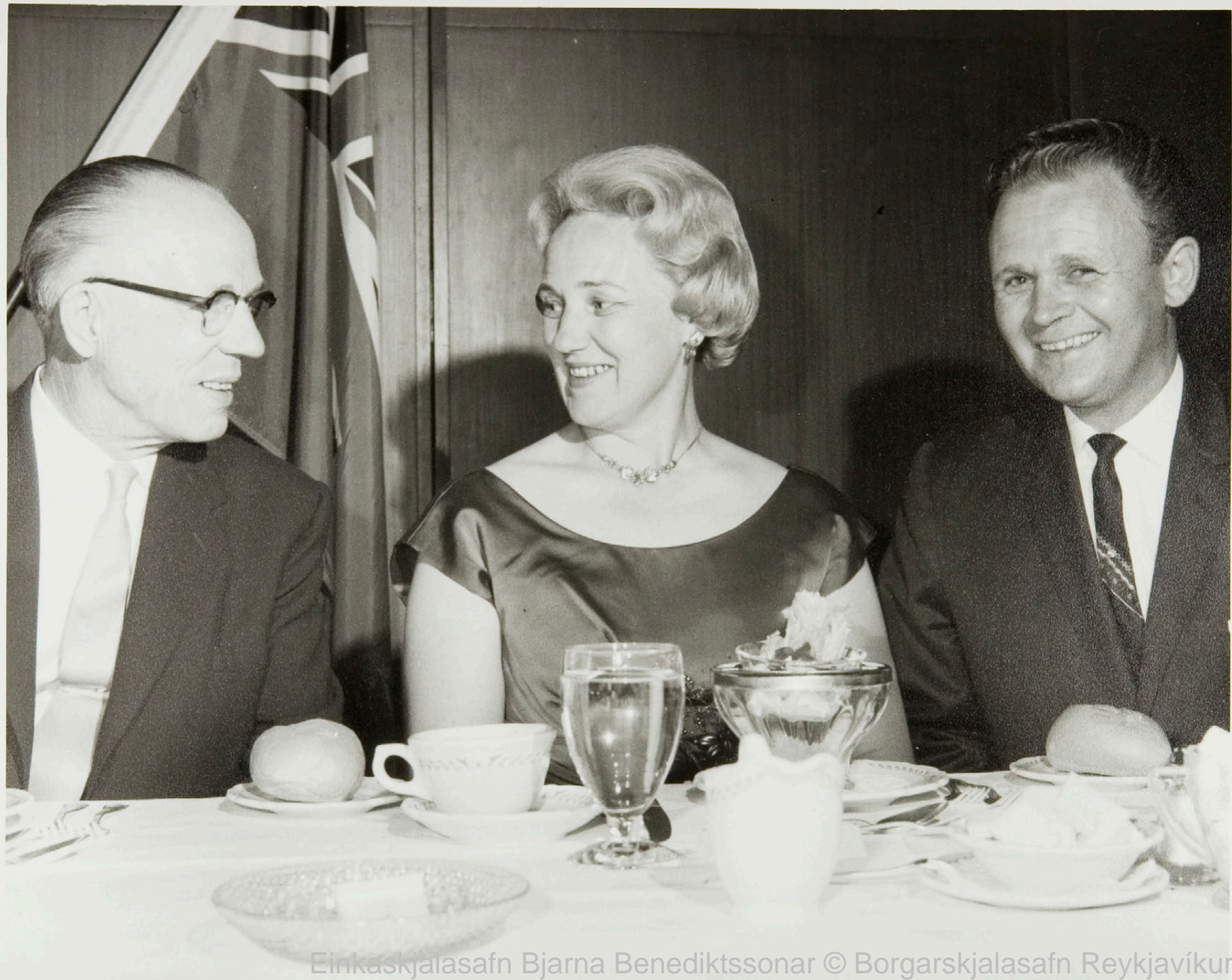
Einkaskjalasafn Bjarna Benediktssonar © Borgarskjalasafn Reykjavíkur