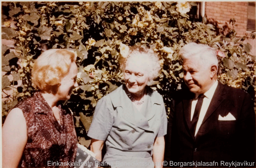
Einkaskjalasafn Bjarna Benediktssonar © Borgarskjalasafn Reykjavíkur