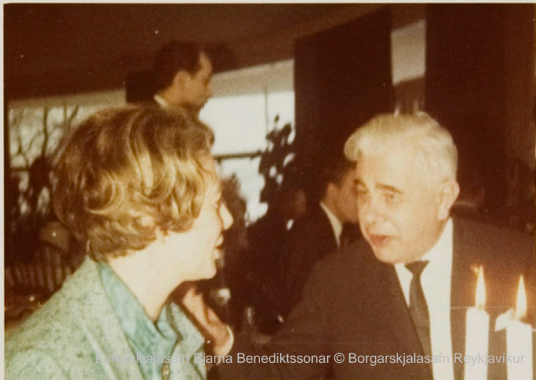
Einkaskjalasafn Bjarna Benediktssonar