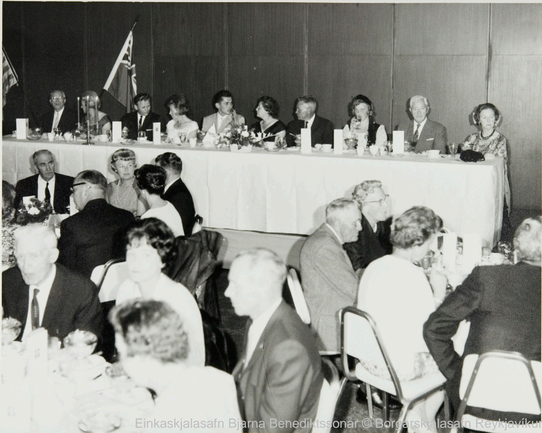
Einkaskjalasafn Bjarna Benediktssonar