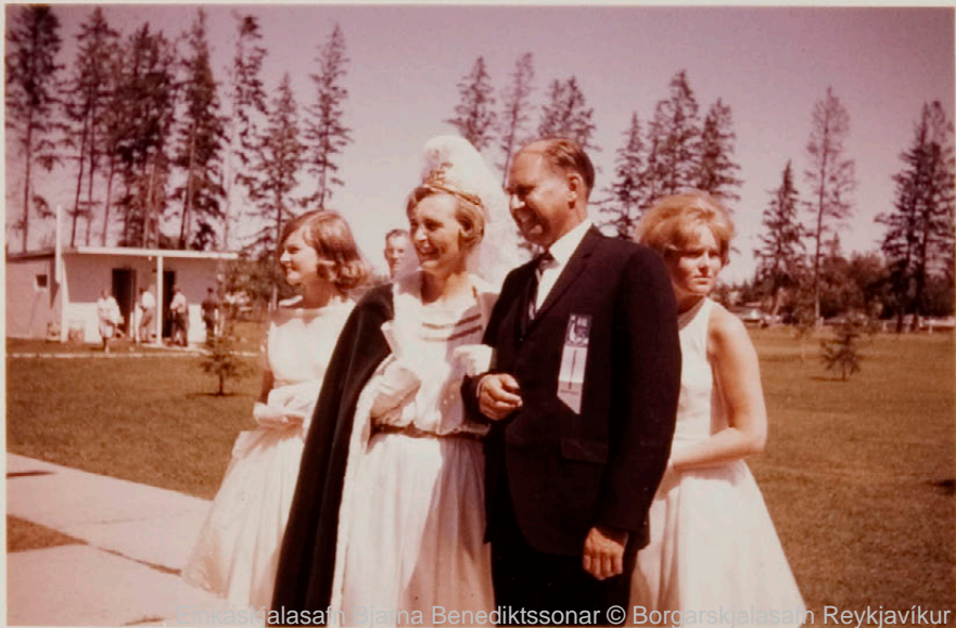
Einkaskjalasafn Bjarna Benediktssonar © Borgarskjalasafn Reykjavíkur