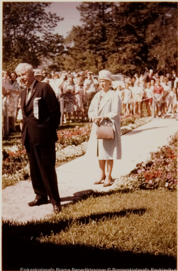
Einkaskjalasafn Bjarna Benediktssonar © Borgarskjalasafn Reykjavíkur