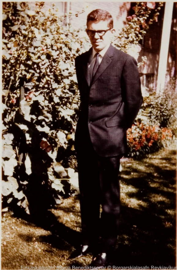
Einkaskjalasafn Bjarna Benediktssonar