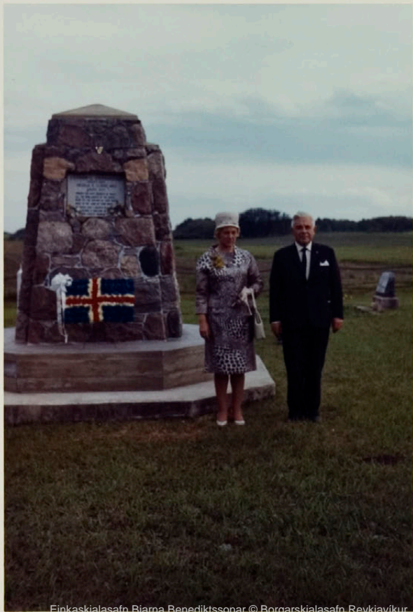
Einkaskjalasafo Bjarna Benediktssonar