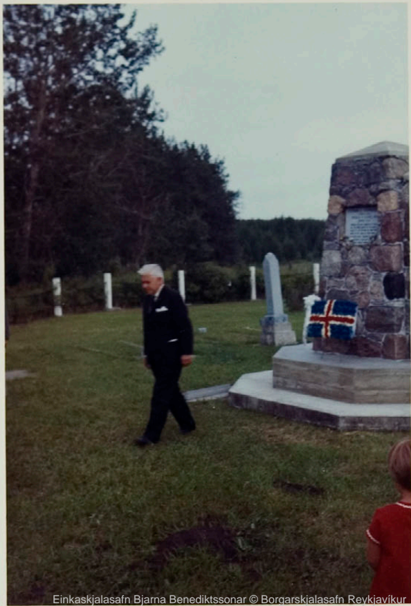
Einkaskjalasafn Bjarna Benediktssonar