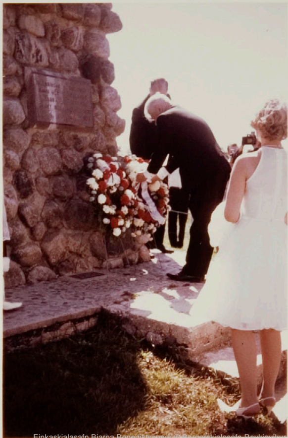
Einkaskjalasafn Bjarna Benediktssonar