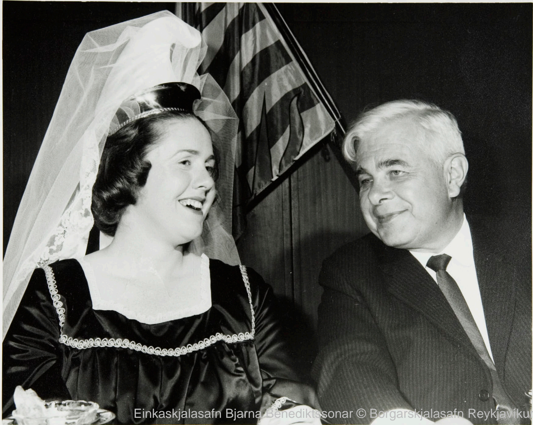
Einkaskjallasafn Bjarna Benediktssonar