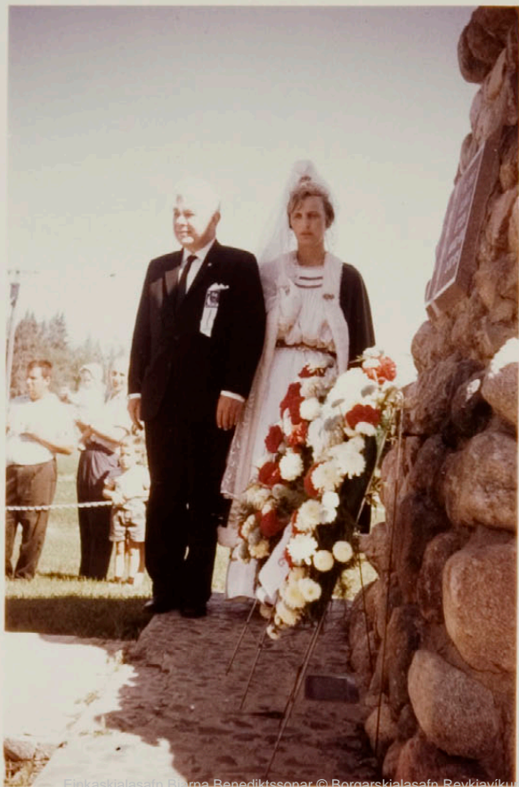
Einkaskjalasafn Bjarna Benediktssonar