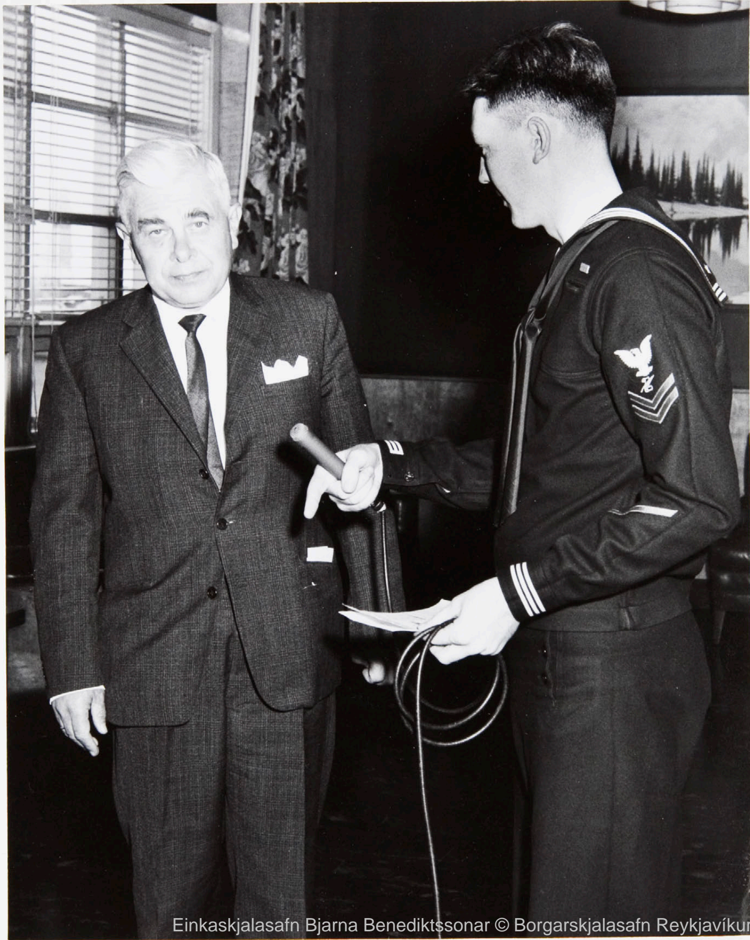
Einkaskjalasafn Bjarna Benediktssonar © Borgarskjalasafn Reykjavíkur