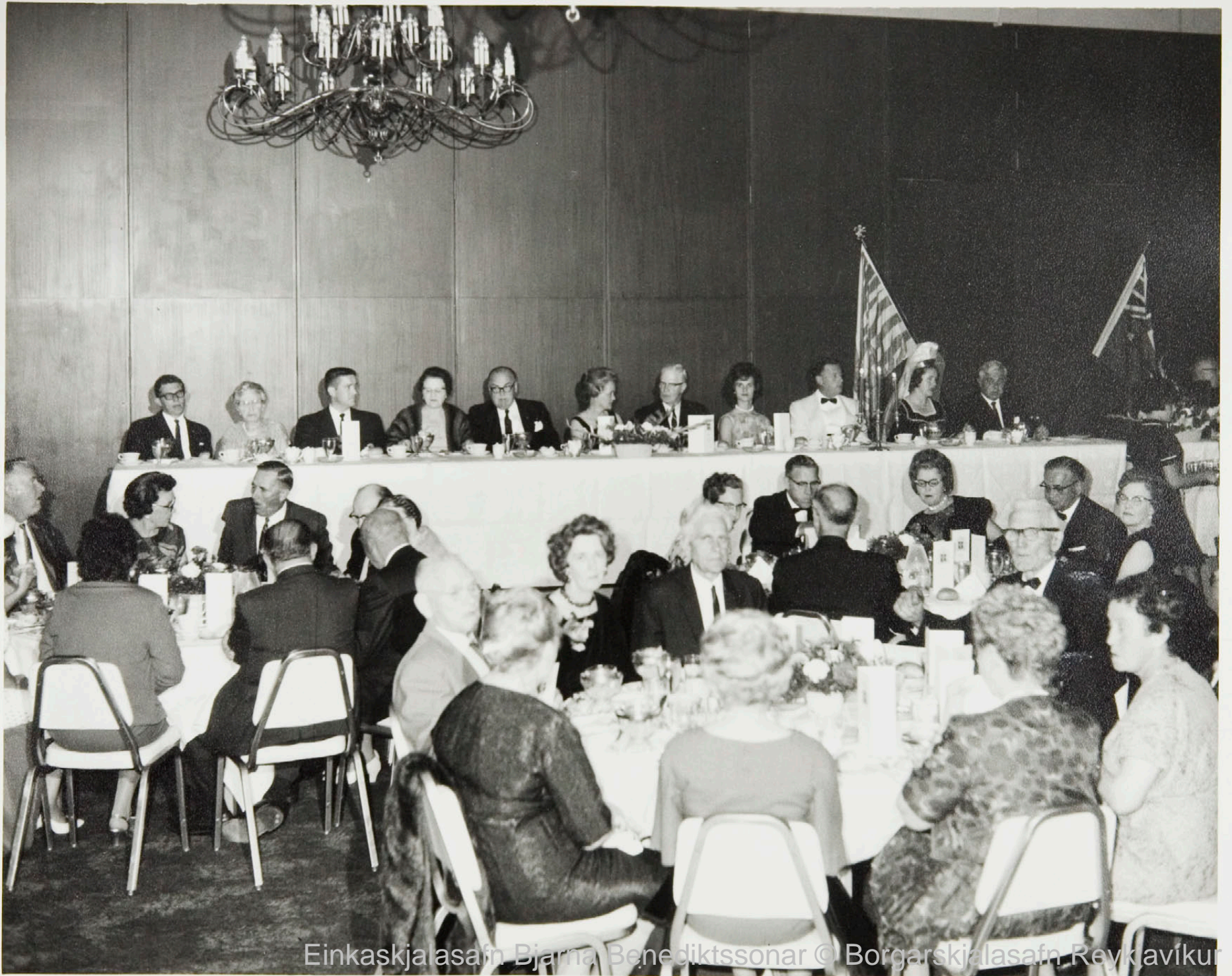
Einkaskjalasafn Bjarna Benediktssonar © Borgarskjalasafn Reykavíkur