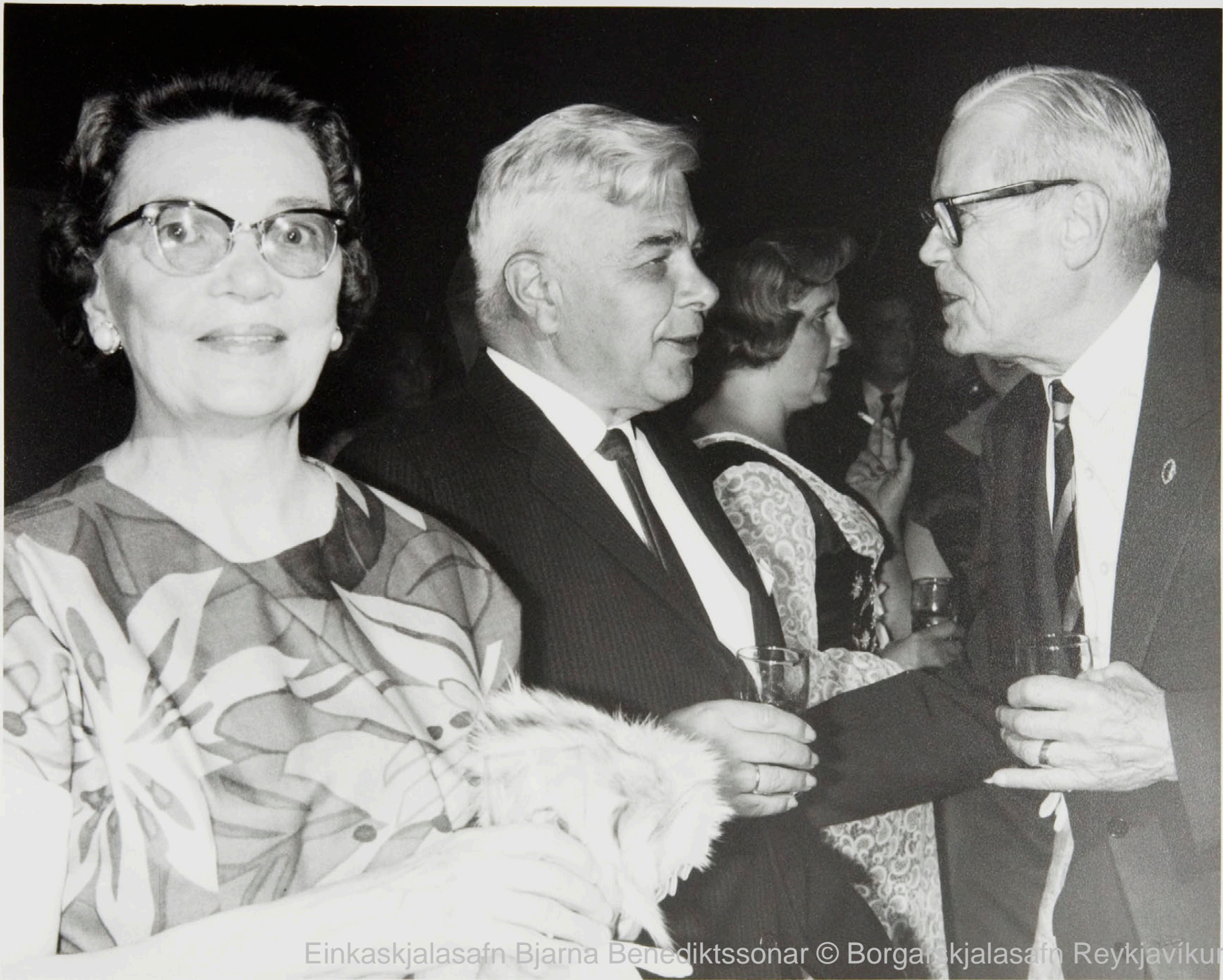
Einkaskjalasafn Bjarna Benediktssonar © Borgarskjalasafn Reykjavíkur