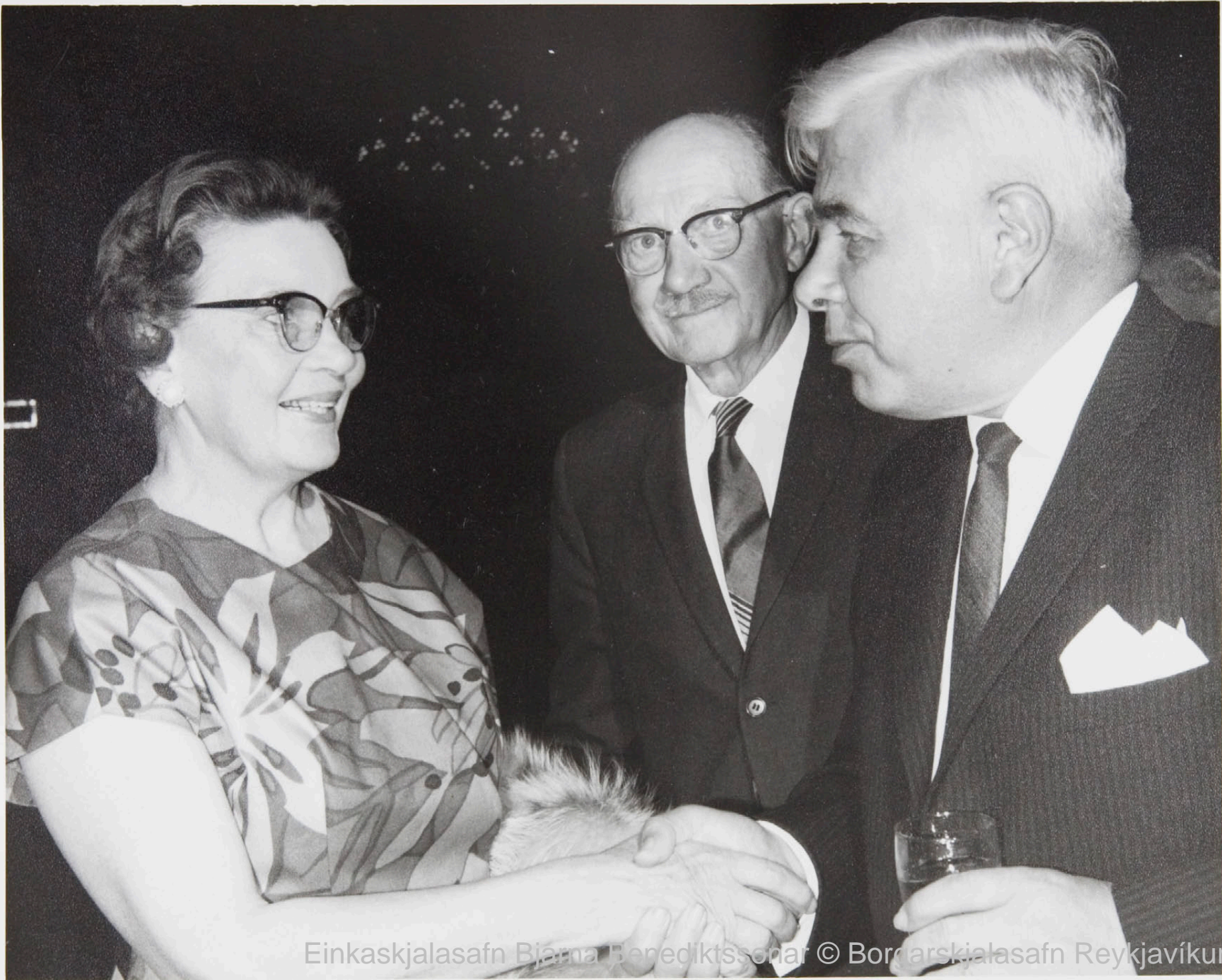
Einkaskjalasafn Bjarna Benediktssonar