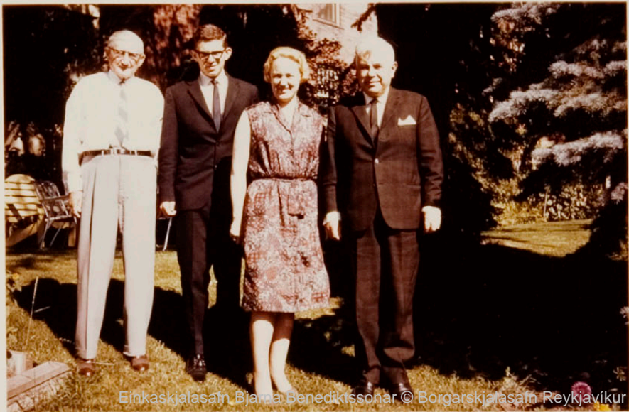
Einkaskjalasafn Bjarna Benediktssonar © Borgarskjalasafn Reykjavíkur