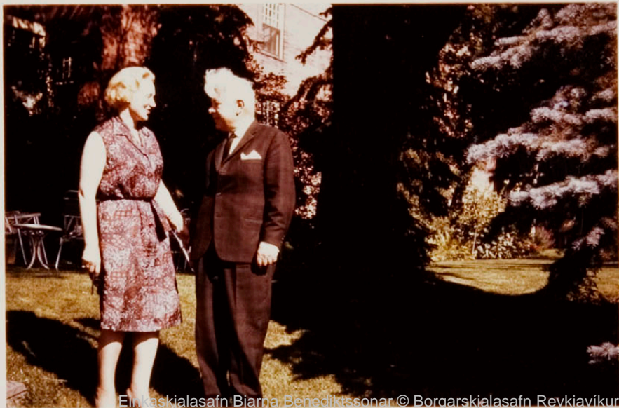
Elín kaskjalasafn Biarna Benediktssonar