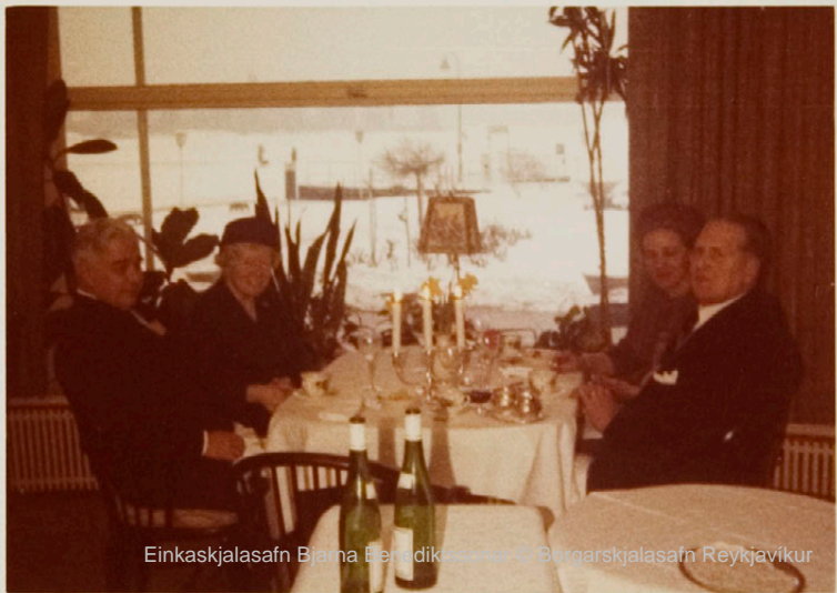
Einkaskjalasafn Bjarna Benediktssonar © Borgarskjalasafn Reykjavíkur