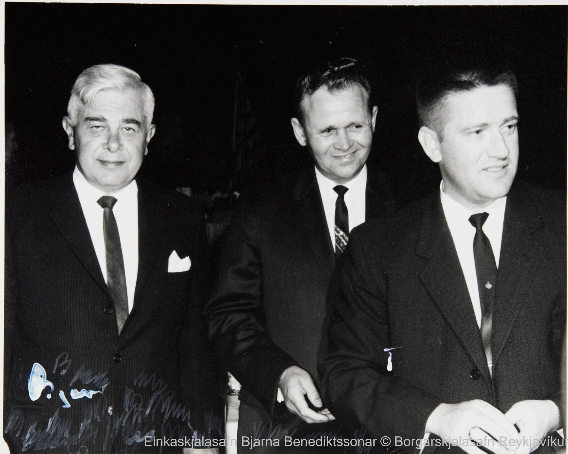
Einkaskjalasafn Bjarna Benediktssonar © Borgarskjalasafn Reykjavíkur