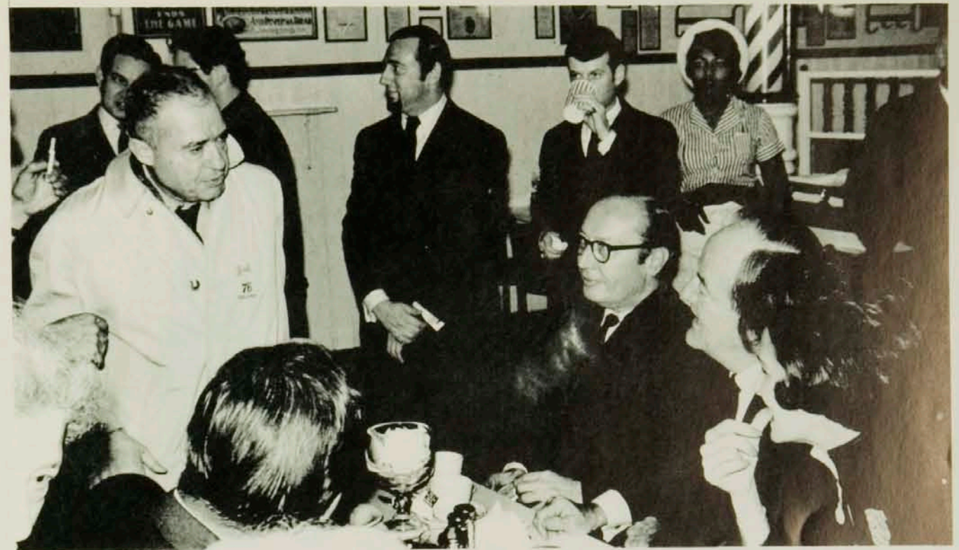
PHILA., PENNA.: VPHHH smiles as we negotiate to clean the table for a regular tip. Back of head belongs to Mike Douglas.