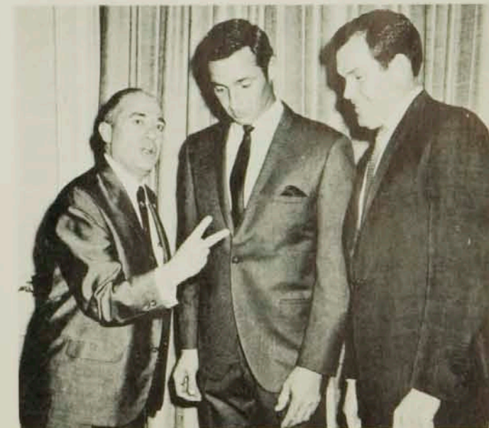
PHILA., PENNA.: Robin Roberts explains the "TWWWWWOOOOOOOO" signal to preplexed Sandy Koufax.