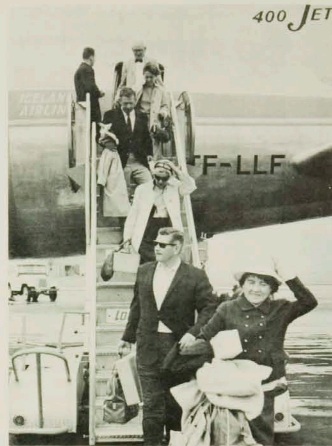
KEFLAVIK, ICELAND: Gets a little nippy in Iceland!