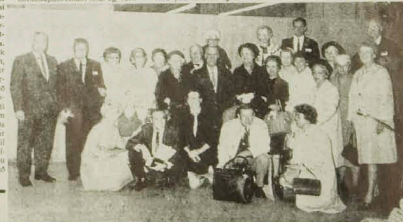
A myndinni sjást fyrrverandi hermenn og hjúkrunarkonur sem störfuðu á Íslandi á stríðsárunum, en fólk þetta fór til Bandaríkjanna í gærkveldi, eftir að hafa dvalið hér á landi í hálfan mánuð og skoðað landið og þá staði sem það dvaldið á.