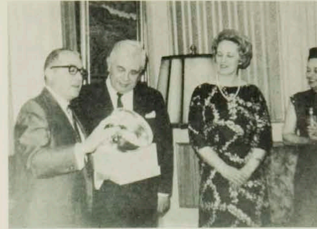
REYKJAVÍK, ICELAND: Prime Minister Bjarni Benediktsson & his wife check the FBI Inscription on his silver bowl.