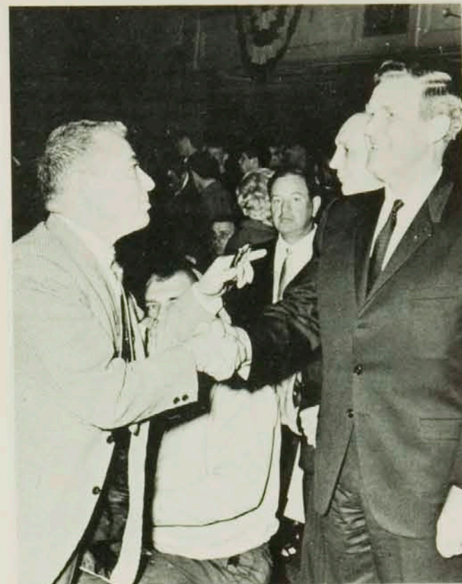
PHILA., PENNA.: Penna. Governor Ray Shafer predicted the NBA title for the 76ers, and the 76ers seconded the motion!