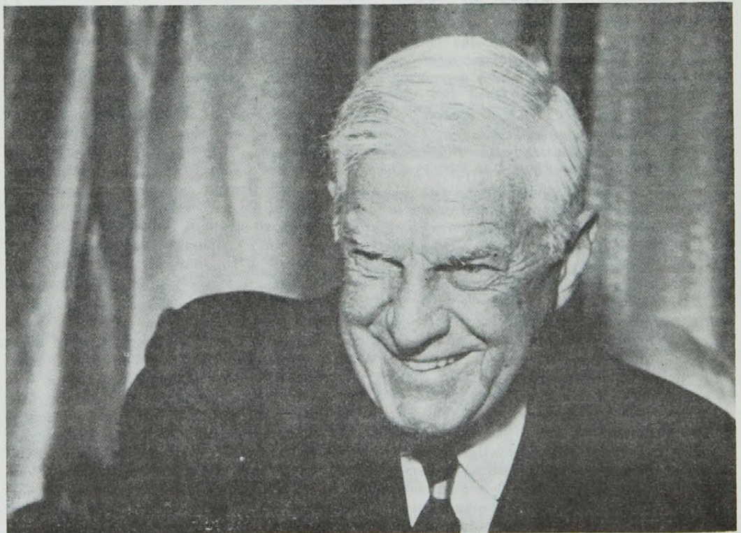
Will L. Clayton, former Under Secretary of State, inspirer of Marshall Plan, Atlantic Union leader.

"A Europe united without the United States can become a Europe united against the United States." This is the dumbbell theory of Atlantic partnership. "Actually, it is not governments which are sovereign. It is people. In a democracy, sovereignty rests with the individual, where it belongs. Clinging to